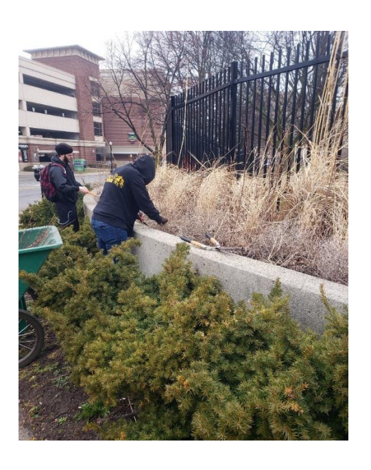
CAS at Anthis students cutting back grasses and perennials