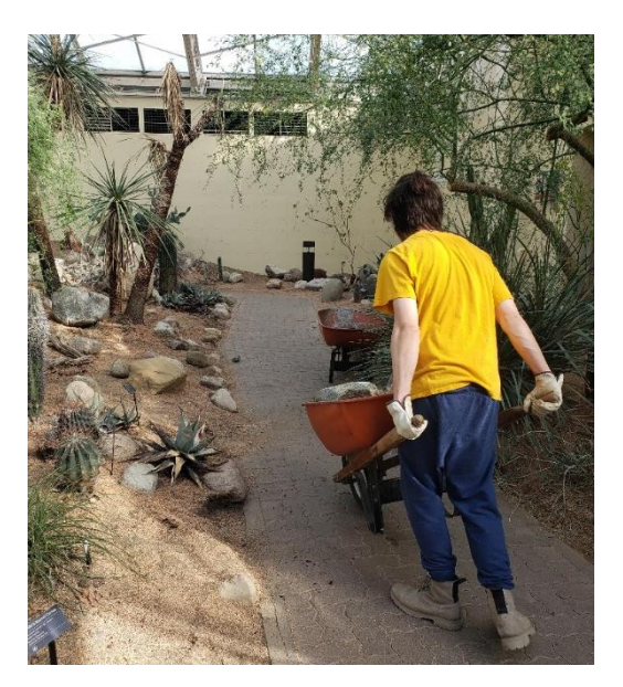
CAS at Anthis students removing rocks from the Desert House