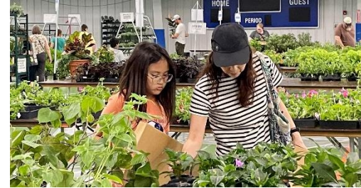
Shopping at the Mother's Day Plant Sale

Held at the McMillen Community Center, the 2023 Plant Sale was staffed by up to 135 volunteers in addition to Conservatory, Greenhouse, and McMillen staff pulling their weight and working together. Everyone's hard work certainly shows considering the success of this year's sale with layout and logistical changes to further improve the customer experience.