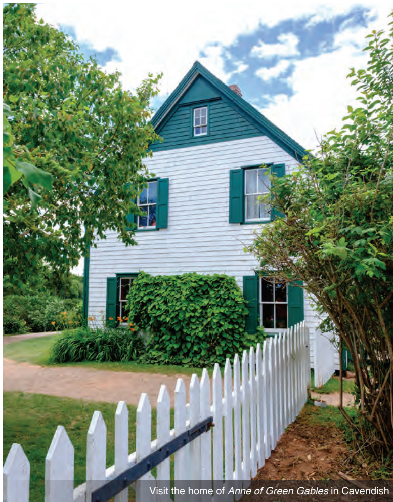
Visit the home of Anne of Green Gables in Cavendish

DAY 7 Shediac Lobster Cruise and Hopewell Rocks: Depart PEI across the nine-mile-long Confederation Bridge to Shediac, “Lobster Capital of the World.” Enjoy a narrated cruise on the warm waters of Shediac Bay while having a freshly cooked lobster lunch. A stop is made at Hopewell Rocks, unique rock formations known for their natural beauty. Meals: B, L