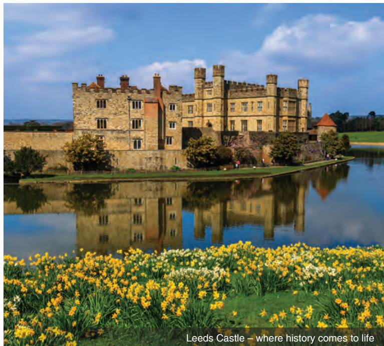
Leeds Castle – where history comes to life

DAY 1 Depart the USA: Depart the USA on your overnight flight to London, England.