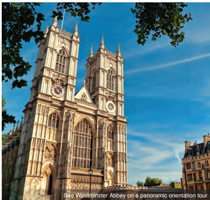
See Westminster Abbey on a panoramic orientation tour