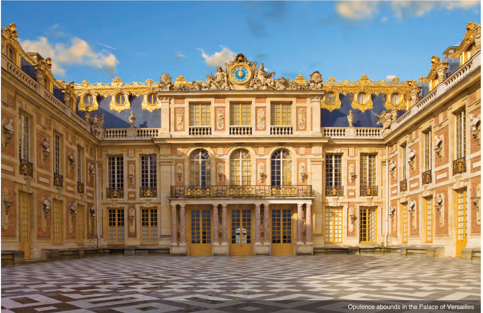
Opulence abounds in the Palace of Versailles