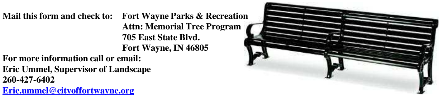
(Note: Double bench shown for illustrative purposes only. Actual bench will be single 6' bench with no center armrest.)

Cost: $2,000.00 (Check or Money Order only, please. Checks should be made payable to Board of Park Commissioners.)