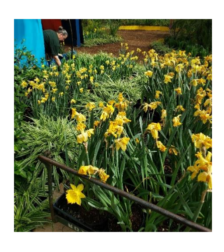
Planting Daffodils in Showcase