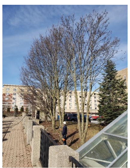
Removing Callery Pear from Terrace