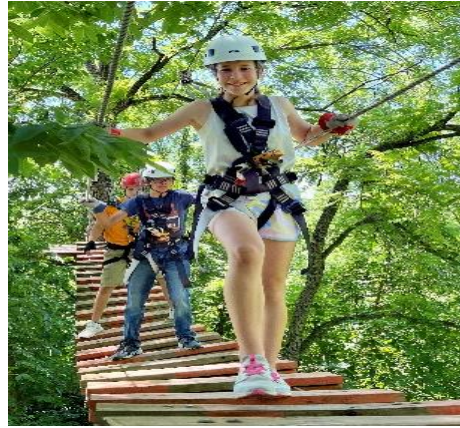
A look at Camp ACTIVenture