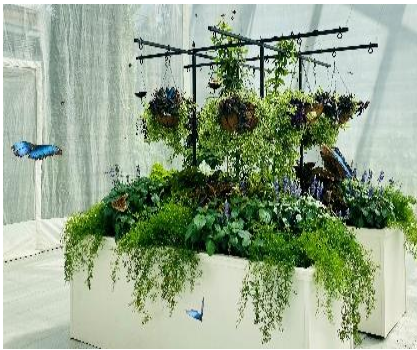
The Plantings for 'Emergence'