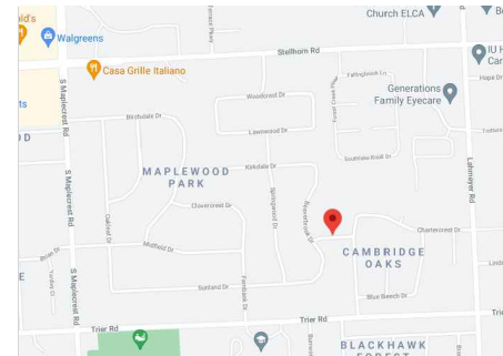
CITY LOCATION - 7011 SHELDON DR.