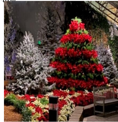
The Poinsettia Tree on display during $1 Night of Lights