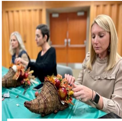
Participants assembling cornucopia centerpieces