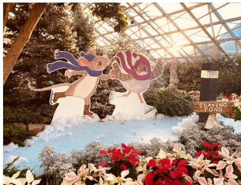
Little Mouse & Wren skating together in Happy Smallidays Holiday Exhibit