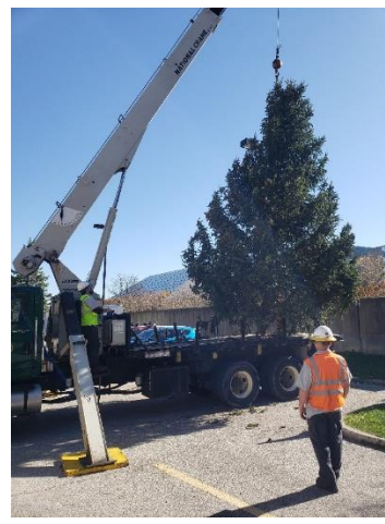
Forestry using a crane to unload harvested donated tree