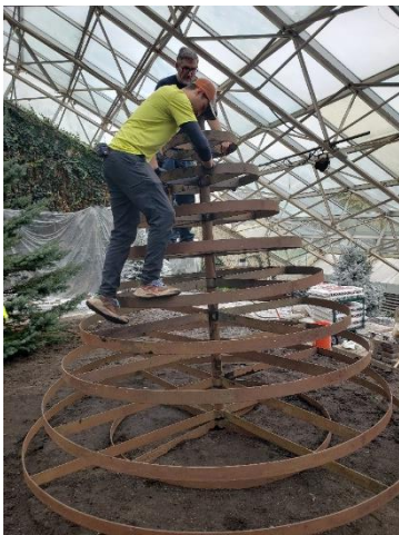
Gardeners Evan Firestone and Eddie Palmer assembling poinsettia tree