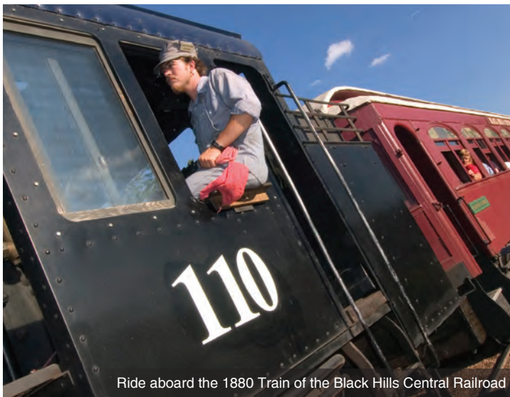
Ride aboard the 1880 Train of the Black Hills Central Railroad

DAY 5 Wall Drug Store and Badlands National Park: Begin the day at the Chapel in the Hills, a quiet retreat nestled at the foot of the Black Hills. Then stop at famed Wall Drug Store, a unique shopping emporium featuring western clothing, Indian pottery and favorite watering hole since the 1930s. Enjoy time for shopping and an on own lunch. Then, a local guide takes you through Badlands National Park, a uniquely beautiful geologic area formed over millions of years by wind, rain and erosion. Later, return to Rapid City for a farewell dinner featuring the entertainment of an Indian dancer, storyteller and flute player. Meals: B, D