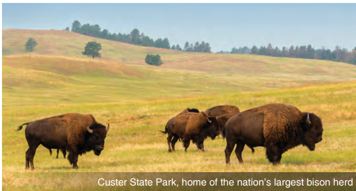
Custer State Park, home of the nation's largest bison herd

Holiday Inn Downtown, Rapid City, South Dakota