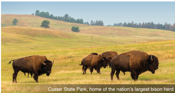
Custer State Park, home of the nation's largest bison herd

DoubleTree by Hilton, Rapid City, South Dakota