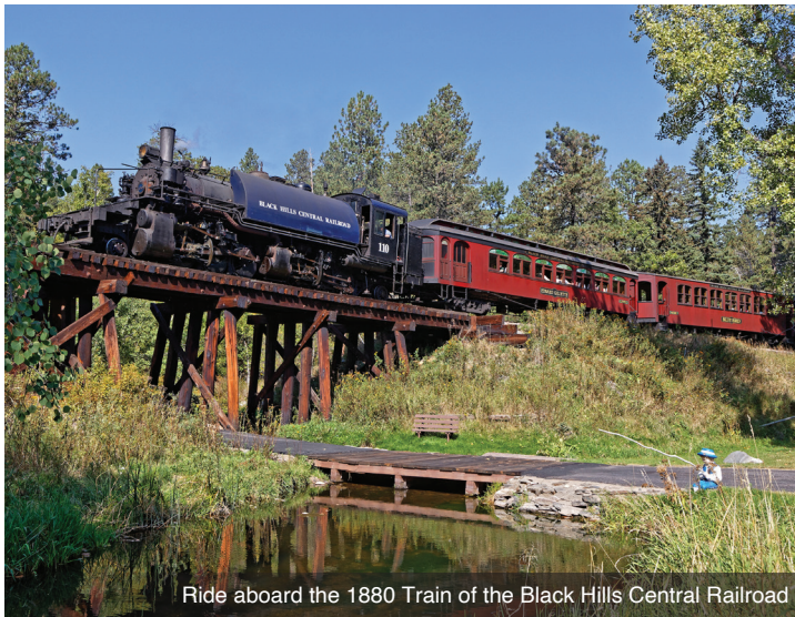
Ride aboard the 1880 Train of the Black Hills Central Railroad

DAY 5 Wall Drug Store and Badlands National Park: Begin the day at the Chapel in the Hills, a quiet retreat nestled at the foot of the Black Hills. Then stop at famed Wall Drug Store, a unique shopping emporium featuring western clothing, Indian pottery and favorite watering hole since the 1930s. Enjoy time for shopping and an on own lunch. Then, a local guide takes you through Badlands National Park, a uniquely beautiful geologic area formed over millions of years by wind, rain and erosion. Later, return to Rapid City for a farewell dinner featuring the entertainment of an Indian dancer, storyteller and flute player. Meals: B, D