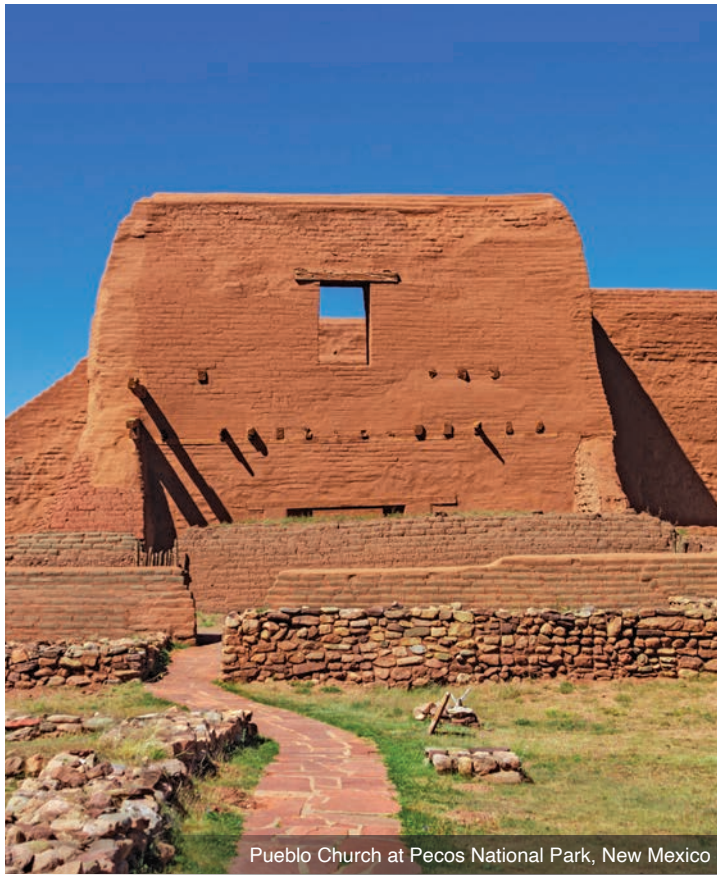
Pueblo Church at Pecos National Park, New Mexico

DAY 5 Pecos National Historic Park: Travel east of Santa Fe to visit Pecos National Historic Park, which features the ruins of Pecos Pueblo and Mission. Pecos encompasses thousands of acres of landscape infused with historical elements from prehistoric archaeological ruins to 19th-century ranches. Tonight, enjoy dinner hosted by your Tour Manager. Meals: B, D