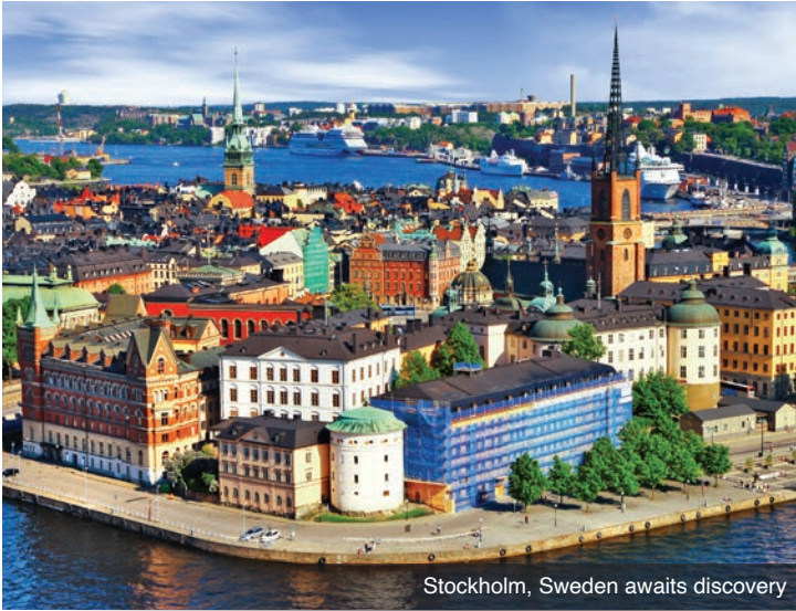
Stockholm, Sweden awaits discovery