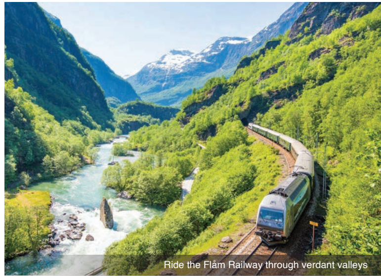
Ride the Flåm Railway through verdant valleys

DAY 1 Depart the USA: Today you'll depart the USA on your overnight flight to Stockholm, Sweden.