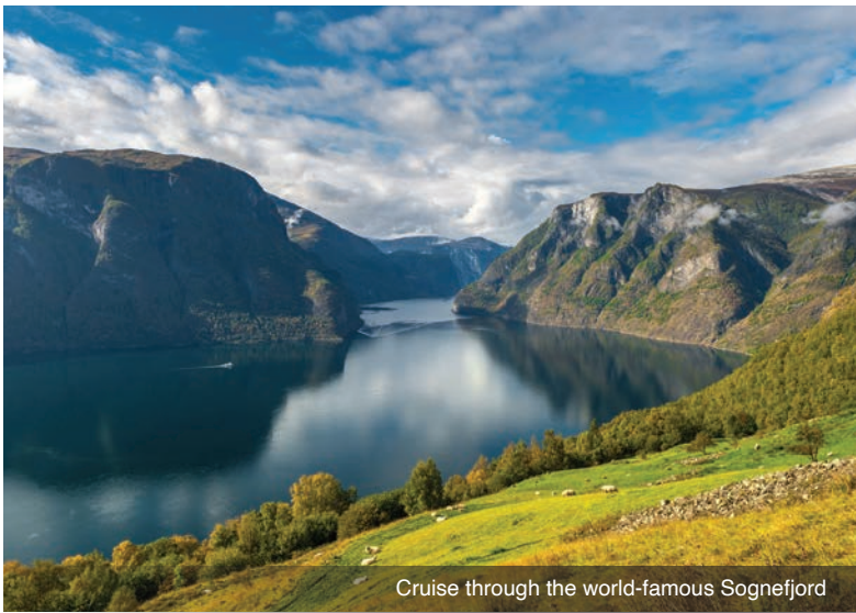
Cruise through the world-famous Sognefjord

World Heritage City, Bergen proudly preserves its rich past, seen in the timbered 15th-century houses, centuries-old warehouses built by seagoing merchants, and a charming labyrinth of cobblestone streets. Nearby, visit Trolldhaugen, the former home and estate of one of Norway's most famous sons, composer Edvard Grieg. The remainder of the day is free to explore this charming city on your own. Meal: B