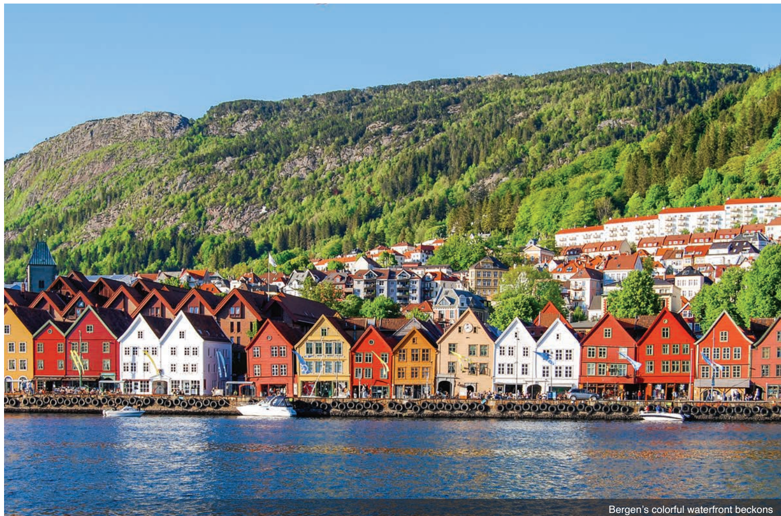
Bergen's colorful waterfront beckons