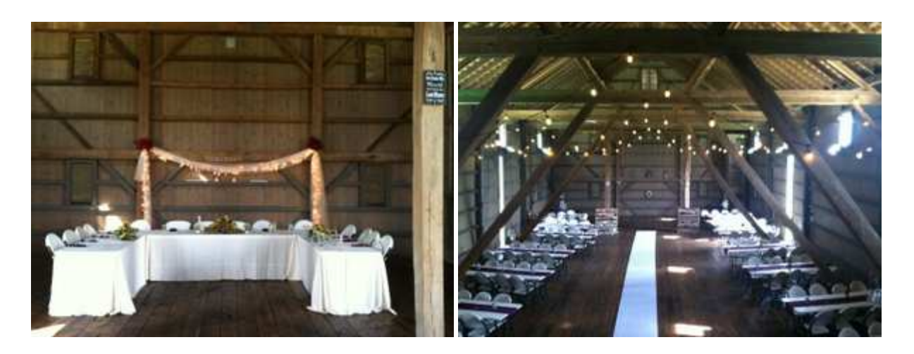
The Wolf Family Learning Center is available for rental all year long (except June and July). Tables and chairs are provided and full kitchen facilities are also available. The capacity of the learning center is 240.

For more information regarding availability and rates please contact (260) 427-6005.